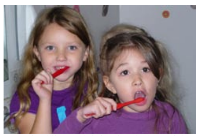
Head Start children are required to brush their teeth each day at school.

Oral Health Educators: Educators based in the Office of Maternal, Child and Family Health provide information about good oral health practices to children in public schools in 38 counties throughout the state, including children in Head Start programs.